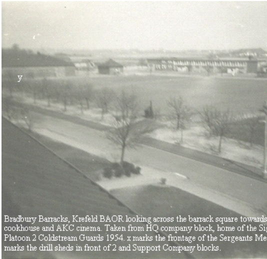
Bradbury Barracks, Krefeld BAOR looking across the barrack square towards the cookhouse and AKC cinema. Taken from HQ company block, home of the Signal Platoon 2 Coldstream Guards 1954. x marks the frontage of the Sergeants Mess. Y marks the drill sheds in front of 2 and Support Company blocks.