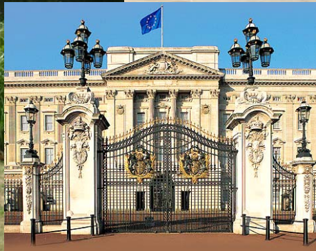
Top Audrey outside Buckingham Palace and left, waiting for the 'Posh Nosh'.