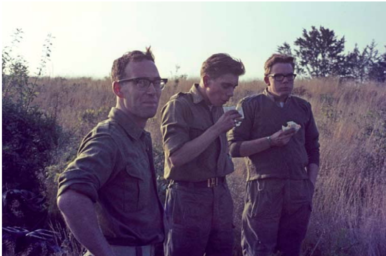
Picture of RR Troop in Sauerland