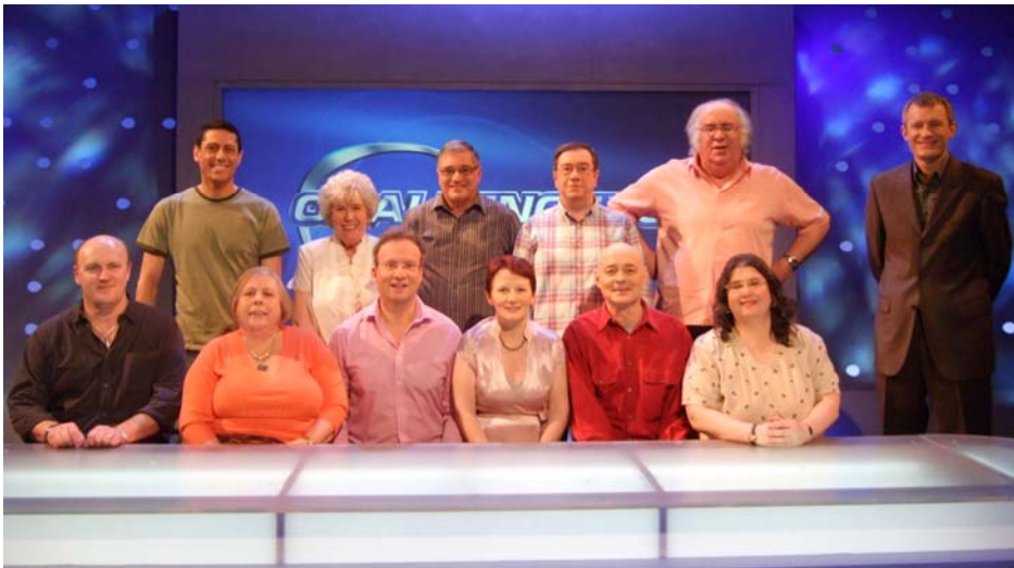
The Eggheads and the Tranceformers with compere Jeremy Vine