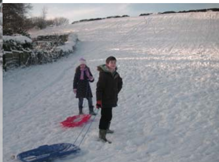
Our grandchildren tackling the pike. How many times do you have to tell boys to keep their hats on??